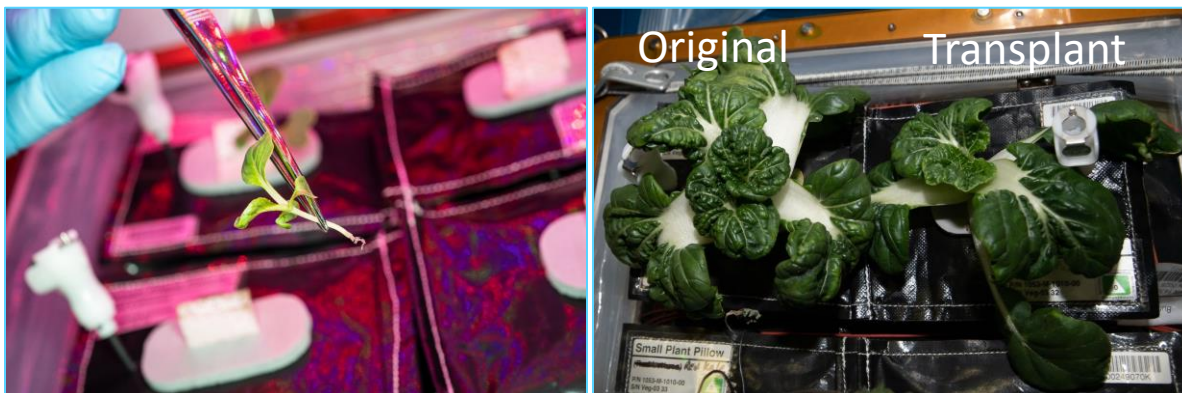
Fig. 2. Left: Pak choi seedling transplanted 10 Days after initiation. Right: Comparison at Day 28 of an original and transplanted pak choi.