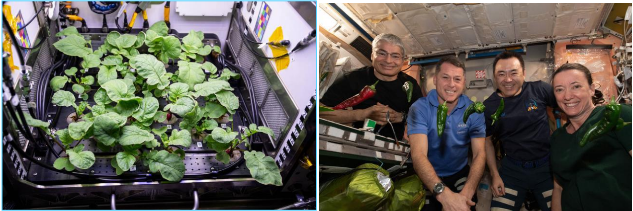
Fig. 1. Left: Radishes grown during PH-02. Right: Crew on ISS with chile peppers from first harvest of PH-04 test with the Advanced Plant Habitat.

The Advanced Plant Habitat (APH) is a quad locker (“oven”) sized plant research chamber installed on the International Space Station (ISS) in November 2018. APH is environmentally closed from the ISS cabin air and has a suite of advanced sensor and control systems, to include automated watering and complete control and command capabilities from the ground. Arabidopsis and ‘Apogee’ dwarf wheat were grown as part of the hardware validation test, followed by experiment PH-01 that also grew Arabidopsis . In December 2020 ‘Cherry Belle’ radishes were grown as part of experiment PH-02. In addition to the valuable science gathered during PH-02, the crew were also able to consume nine of the nineteen radishes harvested. Experiment PH-04, a technical demonstration growing ‘Espanola Improved’ chile peppers began in July 2021 and will conclude in late November 2021. Using chile peppers from the first harvest, the crew made space tacos that received a considerable amount media coverage.