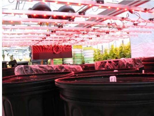
Figure 4. ORBITEC red LED greenhouse supplemental lighting prototype being tested in UW-Madison greenhouse.

ORBITEC has begun testing of solid state greenhouse supplemental lighting systems (Figure 4). These are bar type LED arrays that allow sunlight to pass through. The arrays provide about 200-250 \mu\text{mol}/\text{m}^2/\text{s} of lighting at the plant canopy. The current arrays use only red (627nm) LEDs, but we are fabricating additional test prototypes that will have both red and blue (450nm) LEDs.