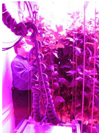
Figure 5. Tobacco plants in ORBITEC red/blue LED growth room.

ORBITEC is continuing to investigate tobacco productivity in controlled environments (Figure 5). This work is being done in preparation for eventual production of industrial proteins using genetically modified plants.