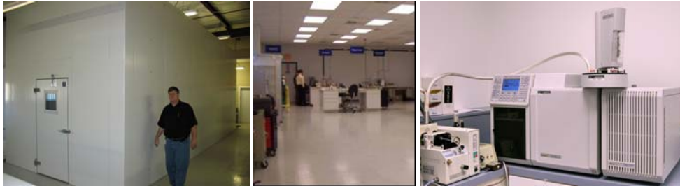
Figure 1. ORBITEC thermal chamber (left), test/assembly area (center), and GC – Mass Spec (right).

ORBITEC has purchased a second building to accommodate construction and testing of large scale flight hardware (Figure 1). The manufacturing and development complex includes a 3,000 ft 2 hardware assembly area that is operated as an ISO 14644 compliant clean room with an airborne particulate count less than 100,000 parts per million (ppm). NASA-STD-8739 workmanship standards are employed throughout the facility with an on-site NASA certified instructor. An additional 350 ft 2 is dedicated to a controlled environmental test chamber, a gas mixing facility, and a mass spectrometry laboratory. A 450 ft 2 reliability testing laboratory is currently being fabricated within the facility. Testing includes; mechanical shock, vibration, thermal cycling, humidity, powered-life testing, and space vacuum. A second room is being constructed as an anechoic chamber to accommodate acoustic emissions testing and acoustic loads for rocket launch simulation.