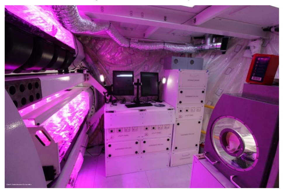
Figure 3. Sierra Space Large Inflatable Fabric Environment (LIFE) mockup. Interior view of habitat showing Astro Garden salad crop production system