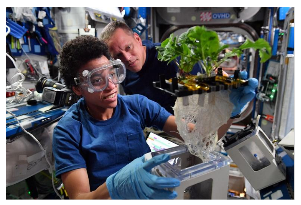
Figure 1. Radish grown in XROOTS payload (6/24/22)

Bare root plant grown in our XROOTS aeroponics/hydroponics payload on ISS (Figure 1). Species grown so far; radish, mizuna, lettuce, dwarf wheat, dwarf tomato.