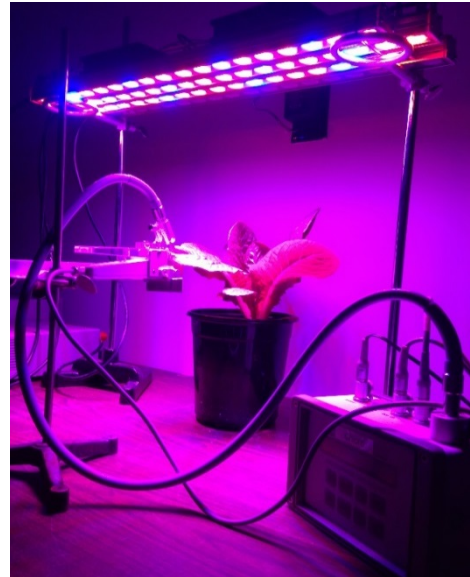
Dedicated room for chlorophyll fluorescence measurements under LED light.

Inside a Conviron E15 growth chamber, we have upgraded a system that can measure chlorophyll fluorescence and quantum yield of photosystem II and calculates electron transport rate. The system can autonomously adjust the light level to achieve a user-defined electron transport rate. The initial setup used four white, 100-W LED modules controlled using pulse-width modulation (rapid on/off control of the LEDs, with intensity determined by the fraction of time that LEDs are on during an on/off cycle). We now have installed new LED lights (combination of red, blue, white, and far-red LEDs, donated by PhytoSynthetix, LLC) that provide a much more uniform light coverage. These lights are controlled using current control ( i.e. , true dimming), which has eliminated almost all noise in chlorophyll fluorescence and light measurements. The setup can be used to test the effect of different lighting strategies on the plant's light use efficiency. The system can measure and maintain specific quantum yields of photosystem II or electron transport rates by adjusting the light intensity as needed.