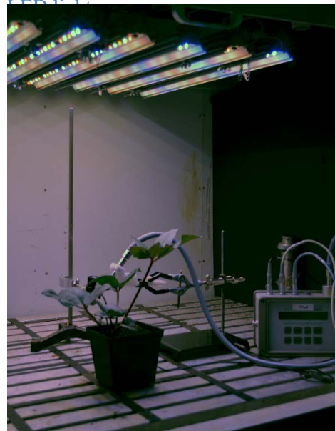
Biofeedback system based on chlorophyll fluorescence measurements. Data collection and light intensity are controlled using a datalogger.