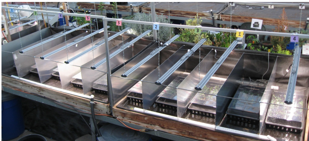
An overview of 10 of the 25 growing areas where different lighting treatments can be tested.

Based on the adaptive lighting controller described by van and Iersel and Gianino (2017), we have developed a system to test different supplemental lighting approaches. The system can implement five different lighting approaches (including one unlit control treatment). Five quantum sensors are used to measure the light level in each of the five treatments. A datalogger can then send a signal to the LED lights (SpydrX, Fluence BioEngineering) to adjust their light output. This allows for excellent control of light levels at the canopy level.