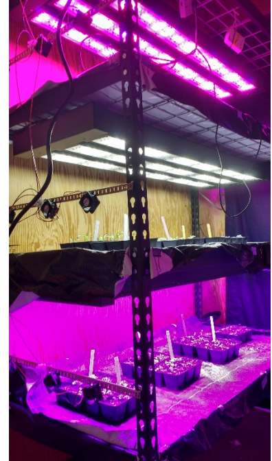
Shelves with fully controllable LED lights (intensity and spectrum)

We have outfitted a room with six LED lights that provide independent control over the intensity of red, blue, white, and far-red light (donated by Aurora). This setup is used to study spectral effects on leaf elongation, light interception, photosynthetic physiology, and crop growth.