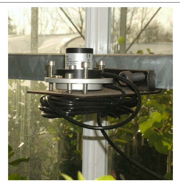
Fig. 1 A quantum sensor on a leveling platform mounted at the top of the canopy for measuring photosynthetically active radiation (PAR). Radiation sensors should be chosen for the specific purpose required. Positioning should be carefully considered to avoid shading or noise from reflective surfaces.