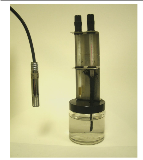
Fig. 2 Water vapour (humidity) sensors may be relatively inexpensive capacitance hygrometers ( left ) or a basic psychrometer ( right ).

absorbs infrared radiation, particularly in the 2,500-3,000 nm waveband, it is important to either remove the water vapour before measurement (by drying for example with a desiccant), adjust the sensor reading to account for the presence of water vapour, or alternately, install a pass-filter (interferometer) in front of the IR detector to ensure that only wavelengths that are absorbed by CO<sub>2</sub> are able to reach the detector. Zero calibration is performed by supplying the sensor with pure nitrogen gas. Additional calibration can then be performed using a calibration gas with a known CO<sub>2</sub> concentration at the high end of the measurement range. When air samples are drawn from (warm) greenhouse sections and pumped to a (colder) CO<sub>2</sub> sensor located outside the greenhouse, care should be taken to avoid condensation in the sampling tube, pumping system, and sensor components.