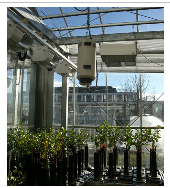
Fig. 3 An aspirated sensor box suspended centrally in free air for recording environmental parameters. The sensors are located inside the box while air is constantly drawn through the box . Sensor ( box ) type and location along with frequency of sampling and details of data integration should be reported.

about the transmission of radiation through the green-house structure. Outside radiation can also be used as input for the greenhouse control strategy [15, 16].